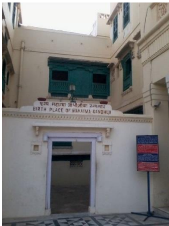
Birth Place of Mahatma Gandhi at Porbandar, Gujarat.

29. What is this occasion when Mahatma Gandhi met CP Ramaswami Aiyar in Trivandrum?