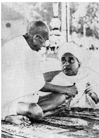
Temple Entry Proclamation in Trivandrum, Travancore state.

29. What is this occasion when Mahatma Gandhi met CP Ramaswami Aiyar in Trivandrum?